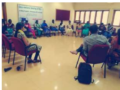
FIGURES 13 AND 14. REFLECT CIRCLE TRAINING, FEB 2017

Training for Reflect Circle was conducted on 16 th and 17 th February 2017 to introduce the concept of Reflect Circle and discuss about various women issues and challenges.