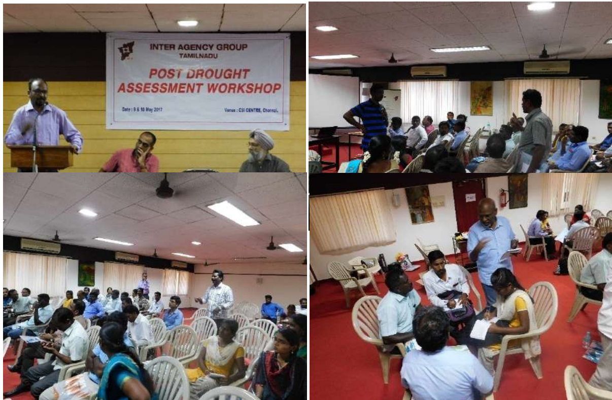
Workshop on “Use of Social Media for Promotion and Protection of Child Rights

There has been increase in migration in last two where people a marginal percentage of migration taking place usually. In the last few months there has been an increase from 6% to 9% in migration from households and amidst this, it has been noticed that a majority of the people who migrate are the landless people and schedule caste. Migration has been going on for the last 2 year and has been on the increase this year where people go to nearby town return in a day or two, to other places in Tamil Nadu and even to other states. This trend has started in the last two year and found to be increasing this year. Enhance the livelihood option in the village to ensure that people do not migrate Enable the migrated families people have access to the PDS in the place where they have migrated.