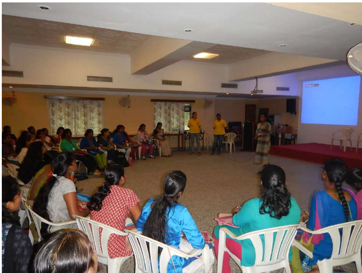
Orientation on prevention of child sexual abuse for volunteers of Young Indians