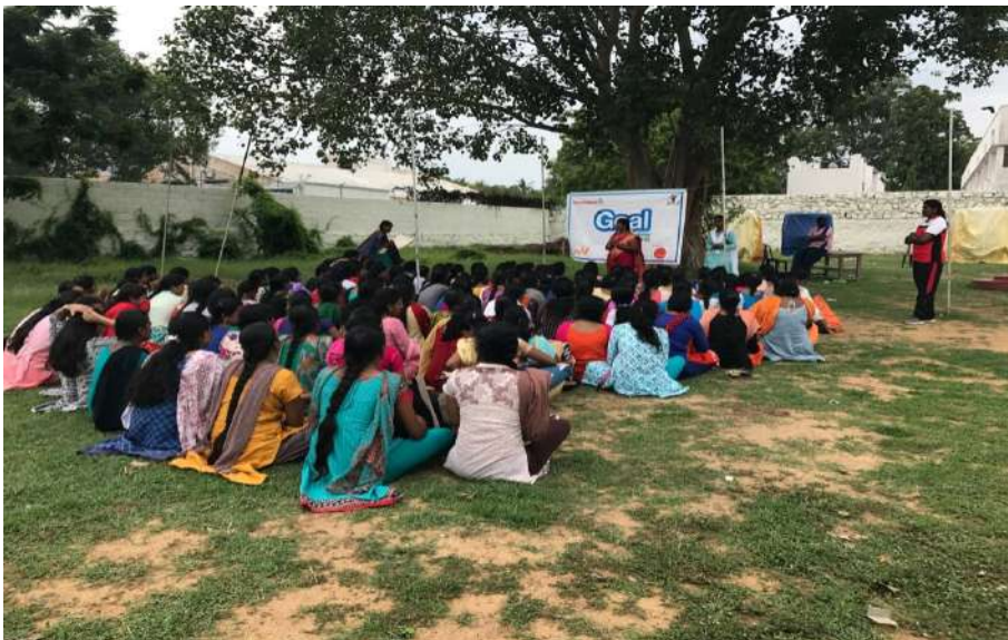
Dr.MGR JANaki Arts and Science College