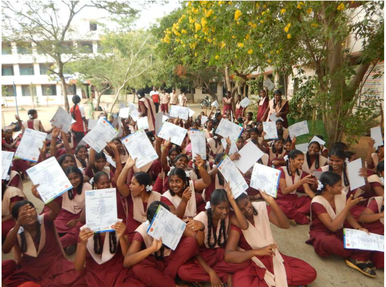
Government Hr.Sec. School -Thoraipakkam: